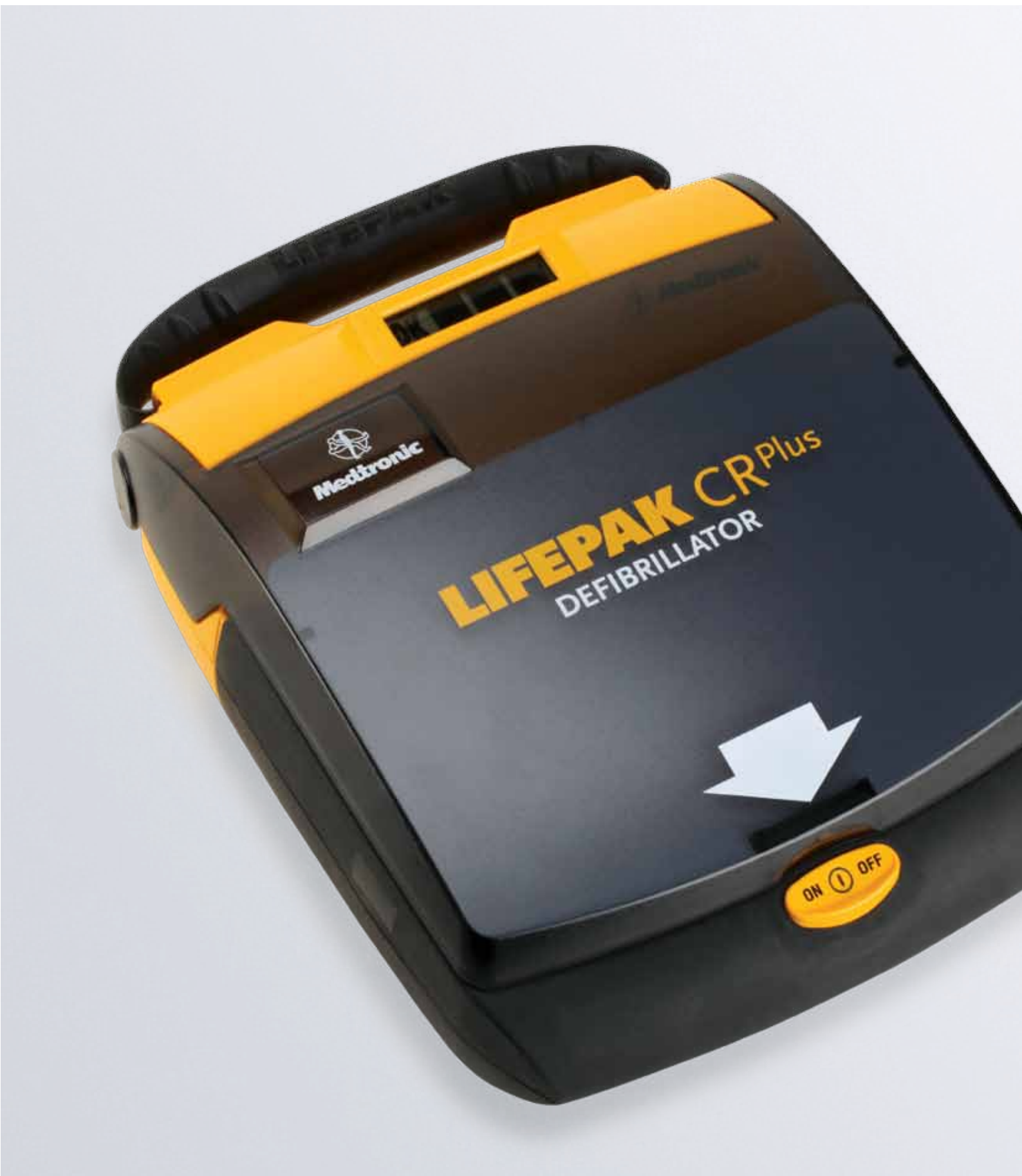
■ LIFEPAK CR Plus AED